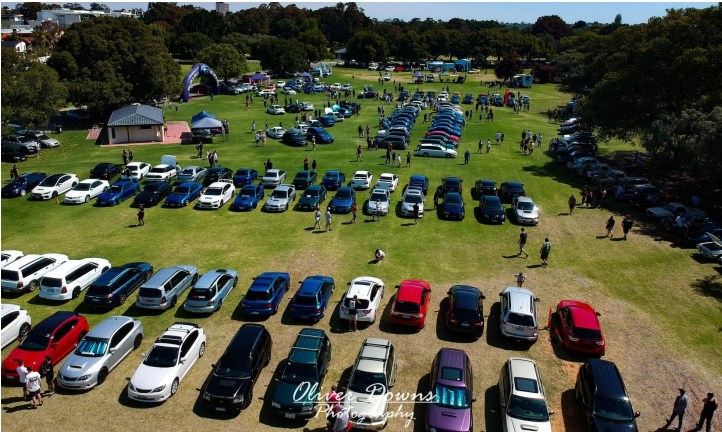
SubieFest 2018. Our display is at the rear of this photo.