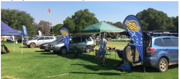
Our display this year at SubieFest

A handful of club members went down to join Perth Subaru Alliance (PSA) in their second annual 'Subie Fest WA 2018' Charity Fundraiser event. There were around 250 Subarus on display in a car show style event. There were cars from the 70s through to the latest and greatest. All participants contributed to raising more than $8000 for the Perth Children's Hospital Foundation. Thanks go to the PSA team on getting that together and making it even better than the previous year's event. Stay tuned as it's set to be an annual event.