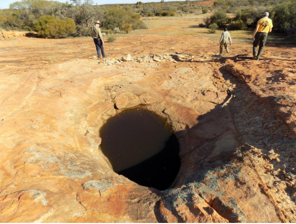
Ularring Rock gnamma

From p.18 Giles recorded this incident as an “attack”. Ularring Rock is part of an extensive area of granitic outcrops. There were a couple of deep gnammas on the rock, still with water in them, and the granite was bisected by several large pegmatite veins. After thoroughly inspecting the rock, we visited the nearby gold mining ghost town of Davyhurst,