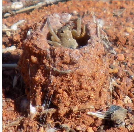
Spider in a turret: probably a Lycosid (wolf spider)