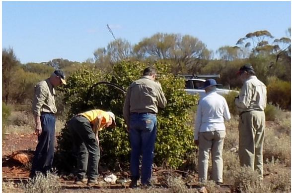
Commemorative bougainvillea at Siberia

From p.17 This was not part of the aforementioned recce and there were forays down several tracks (the Trip Leader is never lost, just exploring!) before we realised that we were searching for Chadwin Well on the map. Chadwin Tank was a different item entirely and eventually we located it a few kilometres away. In the meantime, we had found an abandoned mine – a huge hole in the ground exposing some impressive folded strata. Ever inquisitive, Stephan went for a stroll into the depths down the old interior haul road. At Chadwin Tank numerous Broom Bushes ( Eremophila scoparia ) were blooming with lilac flowers, one of the few displays of wildflowers we'd seen in the area.